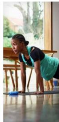
Find your fierce during TV time.