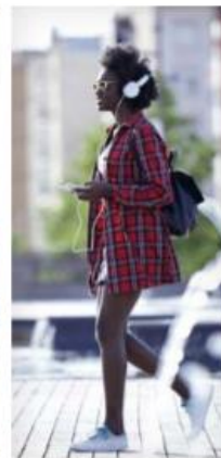
Find your fierce on your way.

Healthy Today is Community Health Centers of Greater Dayton's informational newsletter on healthy living, created with the goal of helping you and your family stay healthy and thriving every day!