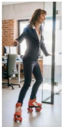
Find your fierce on a conference call.